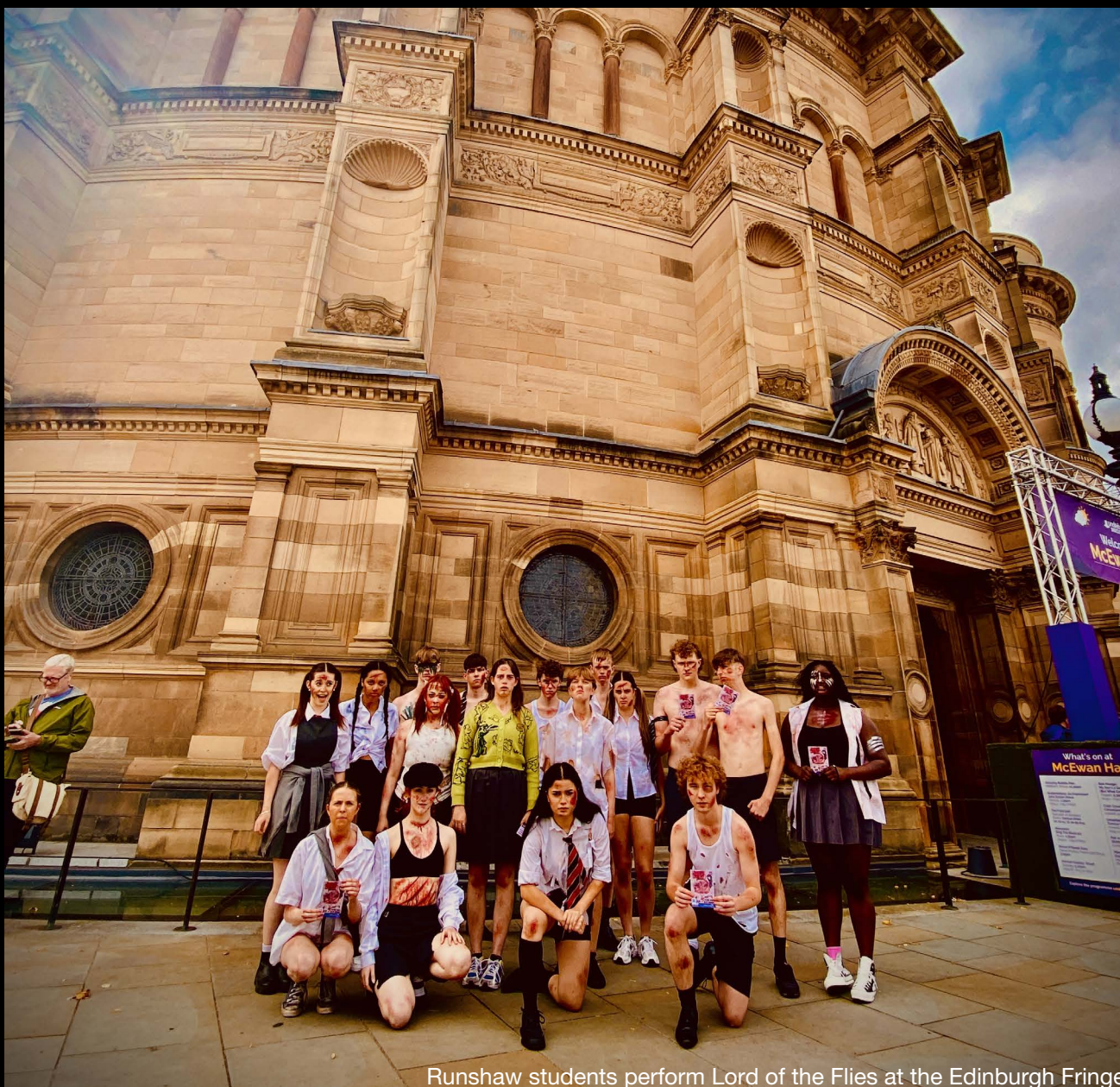
Runshaw students perform Lord of the Flies at the Edinburgh Fringe

Here at Runshaw, we recognise that there is more to life than studying. We encourage all students to take part in activities outside of class time and Runshaw College offers a huge range of different options.